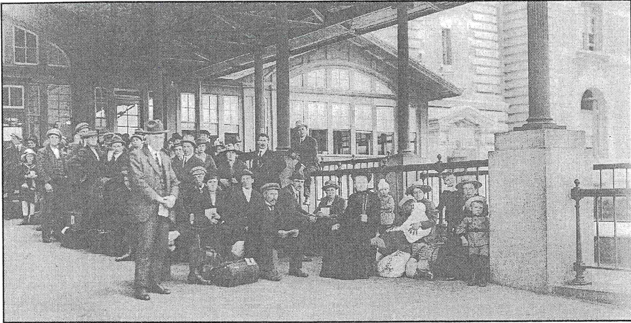
Before being admitted to the United States, immigrants had to pass a medical examination and answer questions from immigration inspectors.

aboard ship practicing their answers to these questions. They knew that if they slipped, they couldn't get in.