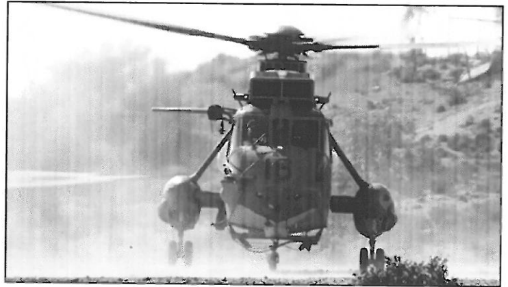
In 2015, the North Atlantic Treaty Organization (NATO) began testing a new "Very High Readiness Joint Task Force." The VHJT will be a multinational brigade that can deploy 5,000 troops within 48 hours.

"Inter" means among or between . It is a prefix that shows there is a connection between things. Intergovernmental organizations are organizations that are formed between governments. They are based on formal agreements between three or more countries that have come together for a specific purpose. For example, several governments might come together to help defend each other against enemy threats. Or, governments might form an organization to solve an environmental problem that is affecting each nation involved.