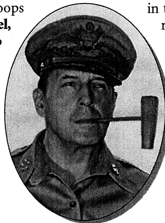
General Douglas MacArthur (1880–1964)

anti-Communist, General Douglas MacArthur was Truman's choice to lead the UN forces in Korea. For MacArthur, the command capped a long, distinguished, and controversial career.