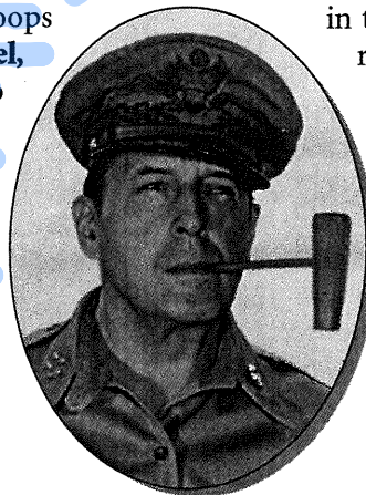
General Douglas MacArthur (1880–1964)

anti-Communist, General Douglas MacArthur was Truman's choice to lead the UN forces in Korea. For MacArthur, the command capped a long, distinguished, and controversial career.